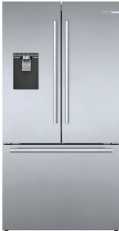
B36CD50SNS Stainless Steel Bar Handle