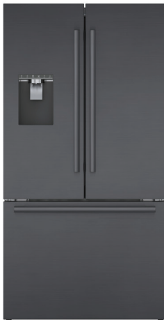
B36CD50SNB Black Stainless Steel Bar Handle