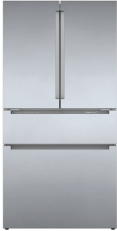
B36CL80ENS Stainless Steel w/ Recessed Handles

Introducing the revolutionary, new FarmFresh System™, with four freshness technologies designed to work together to keep your food fresher, longer. Enjoy less food waste, new innovative features and more thoughtful design.