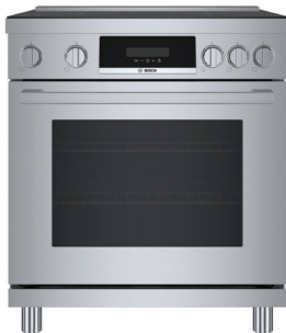
HIS8055C 30" Induction, 4 Elements Stainless Steel