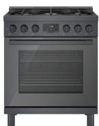
HGS8045UC 30" 5-Burner Black Stainless Steel