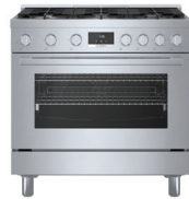
HGS8655UC 36" 6-Burner Stainless Steel