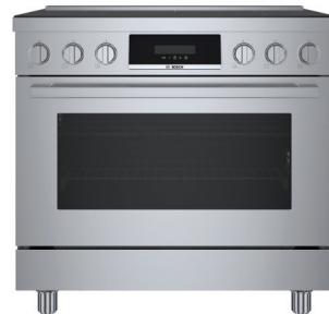
HIS8655C 36" Induction, 5 Elements Stainless Steel

Text "Industrial" to 21432 to learn more.*