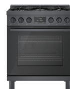
HDS8645C 30" 5-Burner Black Stainless Steel