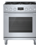
HDS8055C 30" 5-Burner Stainless Steel