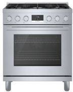
HGS8055UC 30" 5-Burner Stainless Steel