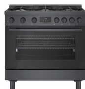
HGS8645UC 36" 6-Burner Black Stainless Steel