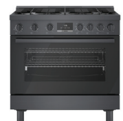
HDS8645C 36" 6-Burner Black Stainless Steel